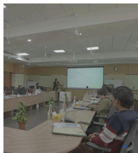
Smart Lecture Theatres