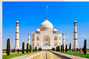
AGRA 4 HRS