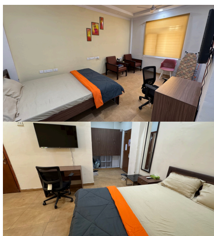
Fully Air-Conditioned Rooms