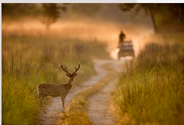
JIM CORBETT NATIONAL PARK 5 HRS