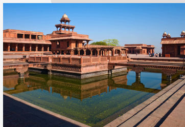
FATEHPUR SIKRI 4 HRS